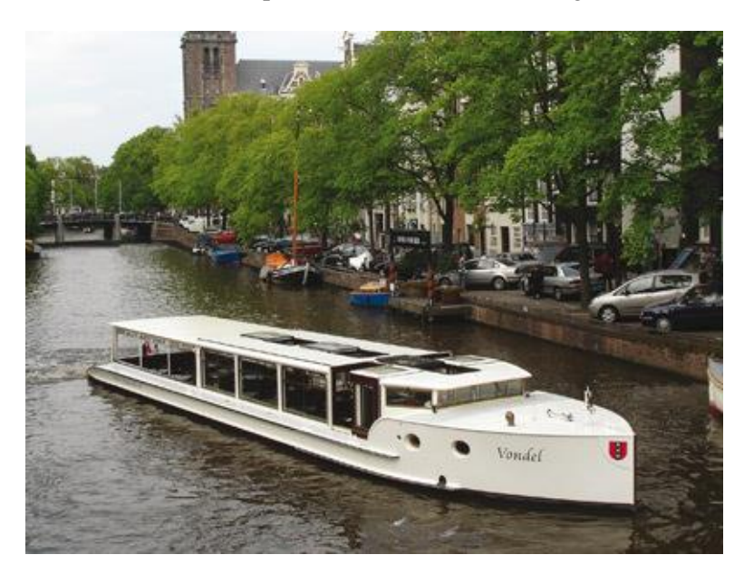
Boarding 19.30 at Stopera, steiger aan de Amstel (boardwalk at the Amstel), Amstel 1 (check the map for hotels Nikhef recommends nearby). Off boarding 21.30 at the same boardwalk.

We will take a boat trip with the "Vondel" including a diner buffet and drinks.